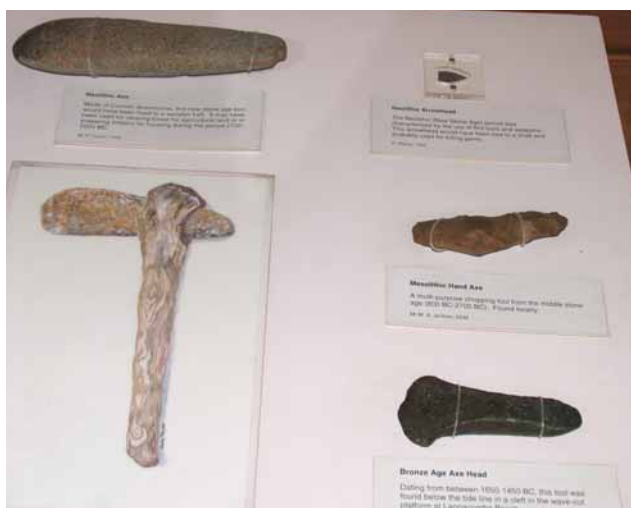
A selection of tools, similar found at locations shown below

These people made no great monuments, mainly living in rough perishable shelters of branches covered with the skins of the animals they hunted. A few lived at the mouths of caves and their living areas and rubbish dumps have been found there, perhaps because they were more likely to have survived in such places.