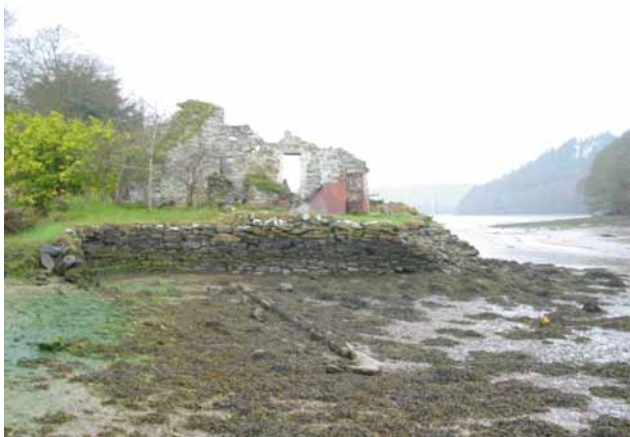
Early Quay at Slade's Mill, Waterhead Creek near Salcombe.

The tidal estuaries of South Devon have been used for at least 2000 years, and probably rather longer, for moving goods and people in boats. Until the medieval period, and for some considerable time afterwards, most landing places for boats were on beaches: boats landing at high tide and beaching themselves to load or unload between tides.