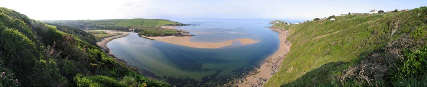
Bantham and Cockleridge Ham from the Avon Estuary Walk

Other unexpected changes are also likely to occur and the photographic record for the project will capture these over time. Overall, the project will provide an interesting insight into 10+ years of South Devon's passing seasons.