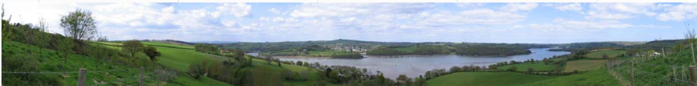
The river Dart, Stoke Gabriel and Galmpton Creek as seen from East Cornworthy