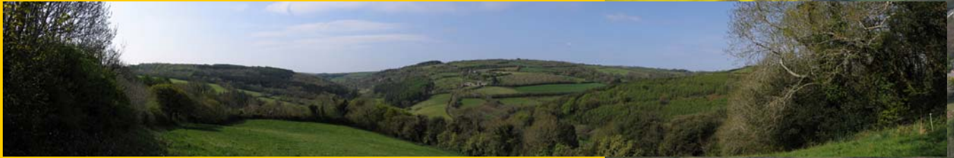
South along the Avon valley from above Curtisknowle South Devon AONB Unit